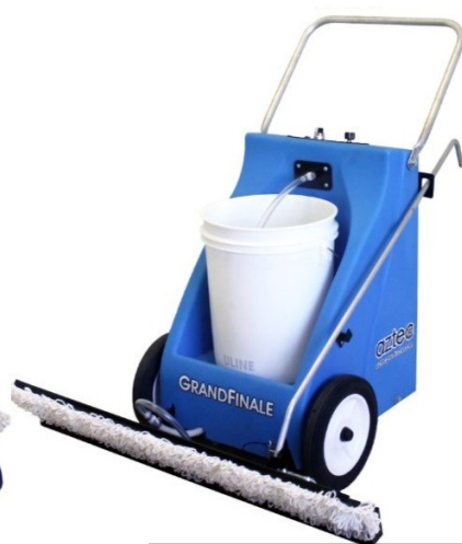
36" Head Assembly: ID# 050-1, 050-H-36