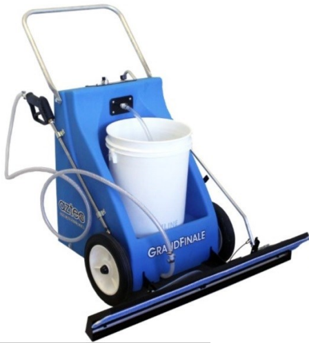
Spray Wand Upgrade: ID# 050-1S, 050-H-36

No puddles, dry spots or streaking thanks to the Grand Finale's battery powered precision release system. Step 5 in the WorkSmart™ VCT Strip System, or as part of the WorkSmart™ Maintenance System or the WorkSmart™ Concrete System. Optional spray wand upgrade.