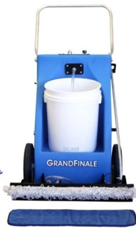
24" Head Assembly: ID# 050-1, 050-H-24