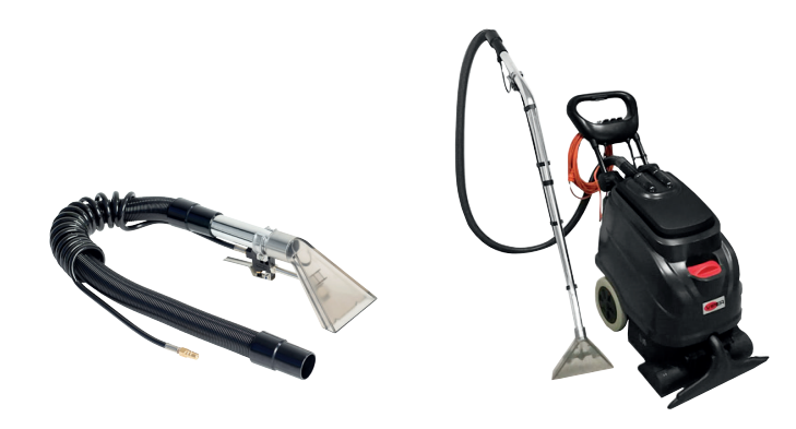
Upholstery hand tool and floor tool as optional accessories