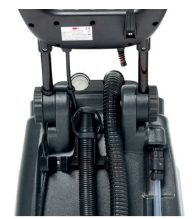
Drain hose for easy emptying