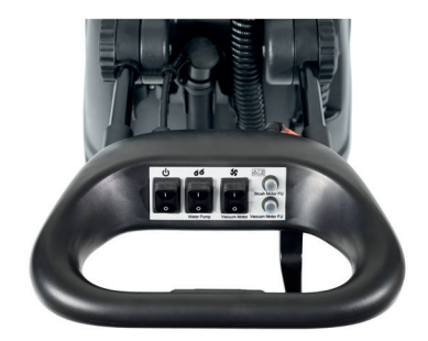
Ergonomic and adjustable handle