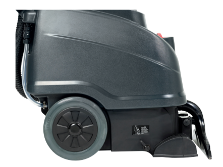
Large wheels for easy transport and maneuverability